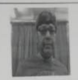
23/11/2015 4:07:28 PM

ASHISH APARTMENT G/G 8 JAYNAGAR, P.O.-JAYNAGAR, P.S.- Baguiati, District-North 24-Parganas, West Bengal, India, PIN - 700059